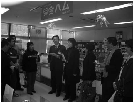
Indonesia Training Course, visit to a Meiho Road Station