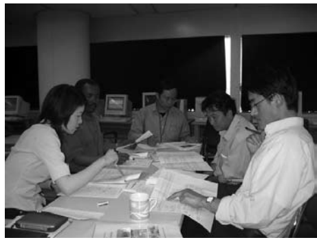
ITC group exercise at UNCRD

thematic training course focusing on human security was launched in collaboration with the Human Security and Regional Development Group during the reporting period. Each course is conducted in Japan to enable participants to learn firsthand from Japan's development experience, particularly of the Chubu region in which UNCRD is located. This constitutes one of the comparative advantages of these training courses.