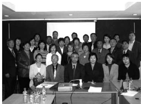
Follow-up seminar in Mongolia

focusing on poverty reduction and empowerment of the poor by making full use of local products and resources such as marine resources for tourism, corn, virgin coconut oil, and marbles, all of which are available in Sulawesi. The concluding course was scheduled to be held in 2008.