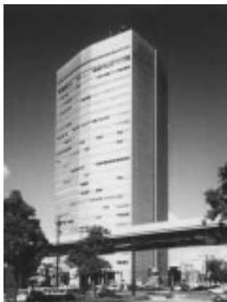
Nagoya International Center (NIC) Building

eight participants from Africa). This constituted Phase 2 of a technical cooperation programme launched in 2001 by the Africa Office and the Government of Singapore.